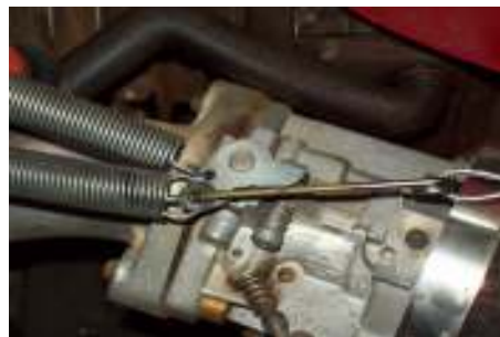
Photo 2: Notice that the springs are attached to the same bracket this is incorrect! They must be mounted on two separate mounting brackets. This way if for any reason one breaks you will still have one spring attached.

Photo 1: This is the correct way to attach the throttle return springs on the carburetor Notice they are mounted on two different Locations and not together;